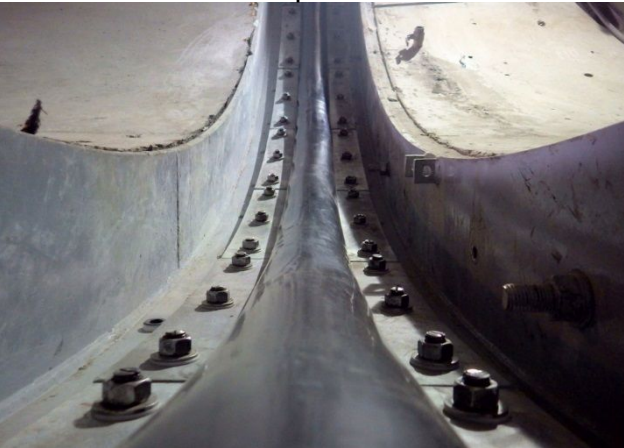
9. Watertightness test at site