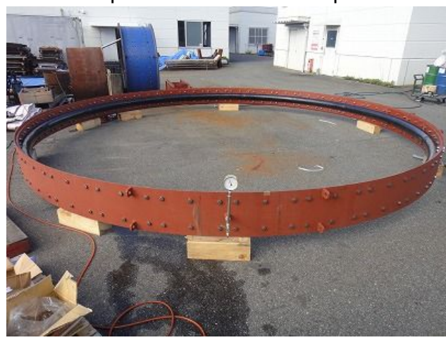
2. \Omega seal