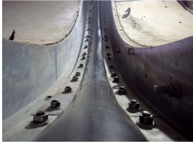
8. Installation completion of \Omega seal