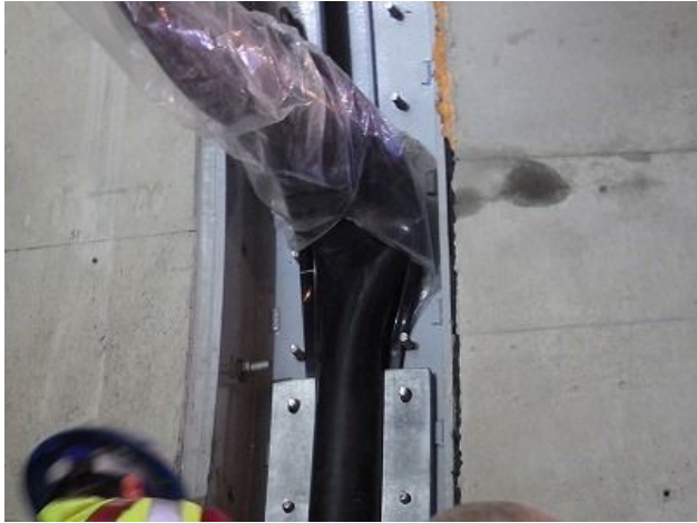
7. Installation of retainers