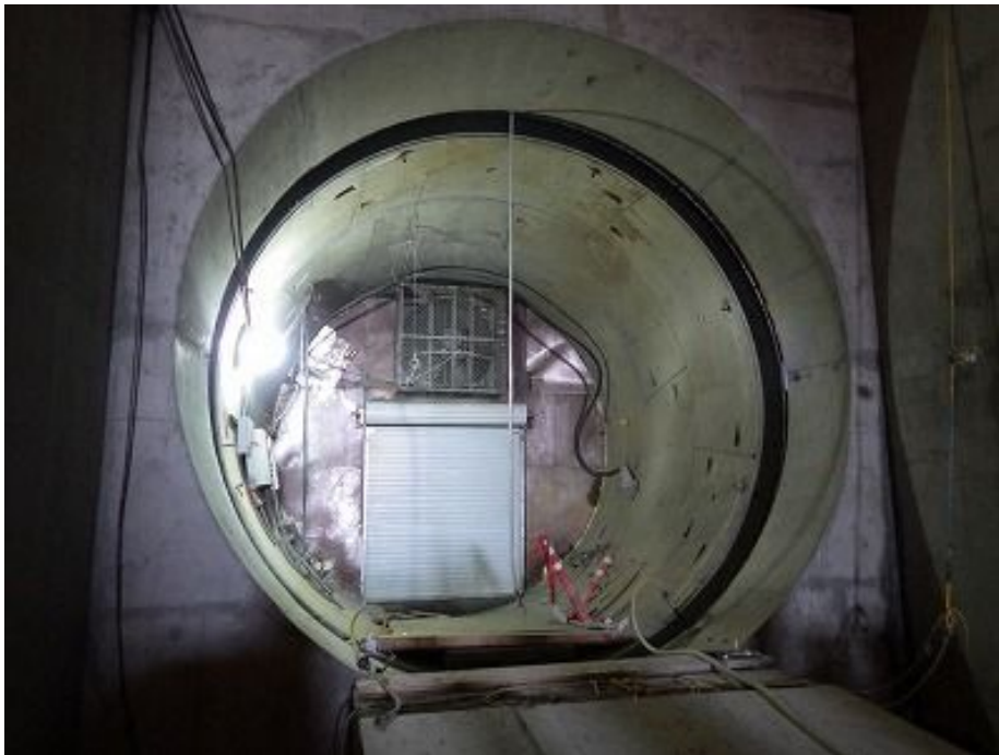
10. Work completion