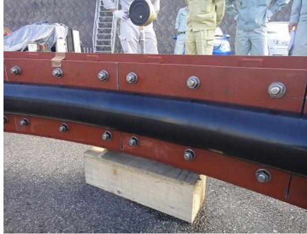
2. \Omega seal