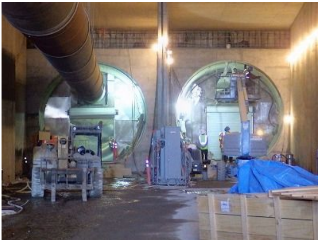
4. Tunnel eye concrete