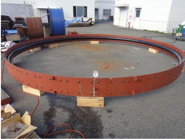
1. Water pressure test in our plant