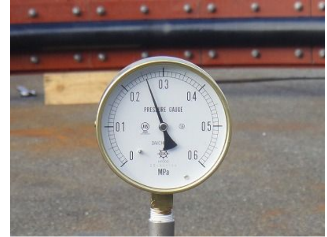
3. Holding pressure; 0.25MPa